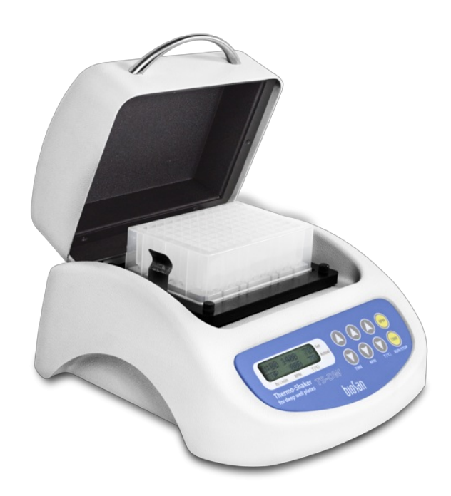
TS-DW Without thermoblock Thermo–Shaker for Deep Well Plates

TS-DW Thermo—Shaker is designed for shaking and incubating deep well plates.