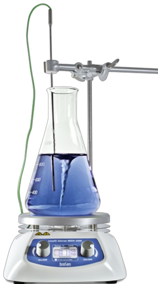
Intelli-Stirrer MSH-300i BS-010309-AAA Magnetic Stirrer with hot plate