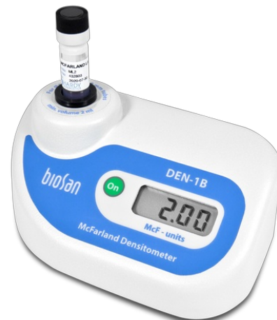
DEN-1B BS-050104-AAF Densitometer (suspension turbidity detector)

Densitometer is designed for measurement of cell suspension's turbidity in the range of 0.0–6.0 McFarland units (0 – 180 \times 10^7 cells/ml).