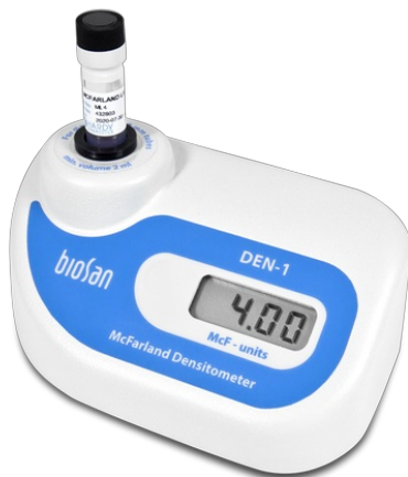
DEN-1 BS-050102-AAF Densitometer (suspension turbidity detector)

Densitometer is designed for measurement of cell suspension's turbidity in the range of 0.0–6.0 McFarland units (0 – 180 \times 10^7 cells/ml).