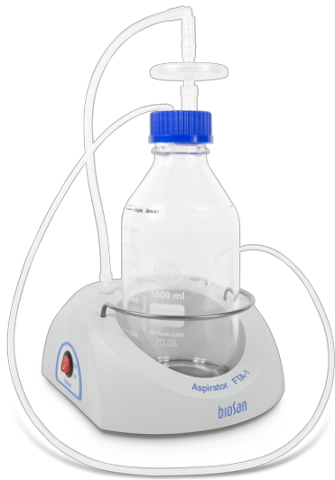
FTA-1 BS-040108-AAG Aspirator with trap flask

Aspirator with trap flask FTA-1 is designed for aspiration/removal of alcohol/buffer remaining quantities from microtest tube walls during DNA/RNA purification and other macromolecule reprecipitation techniques.