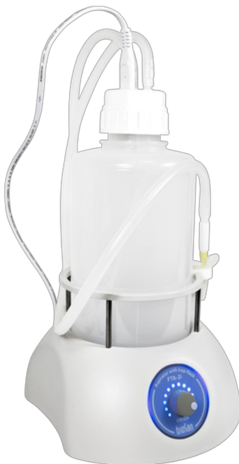
FTA-2i BS-040120-A02 Aspirator with Trap Flask

Aspirator with trap flask FTA-2i is designed for aspiration or removal of alcohol, buffer and liquid from reaction vessels (e.g. during DNA/RNA purification or other macromolecule reprecipitation techniques).