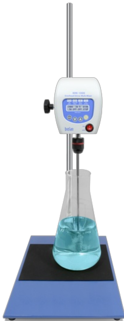
MM-1000 Without stirrer Overhead Stirrer Multi Mixer