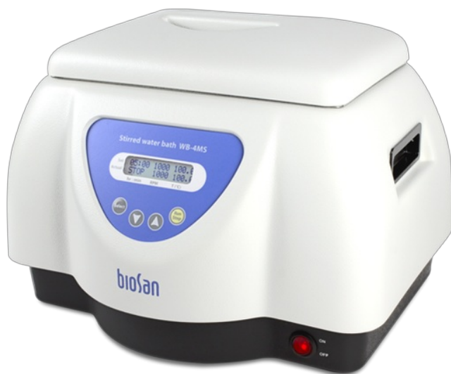
WB-4MS With base BP-1 and lid Stirred water bath

Water bath-thermostat WB-4MS is designed for chemical, pharmaceutical, medical and biological laboratory research.